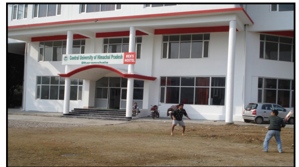
Men's Hall of Residence

It also has internet facility. It is proposed that the students shall run the mess of the hostel on cooperative basis having liberty to decide menu of their own choice. The university will provide transport facility from hostel to TAB Shahpur.