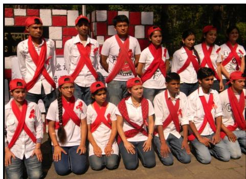
Members of Red Ribbon Club of CUHP

The training which makes men happiest in themselves also makes them most serviceable to others